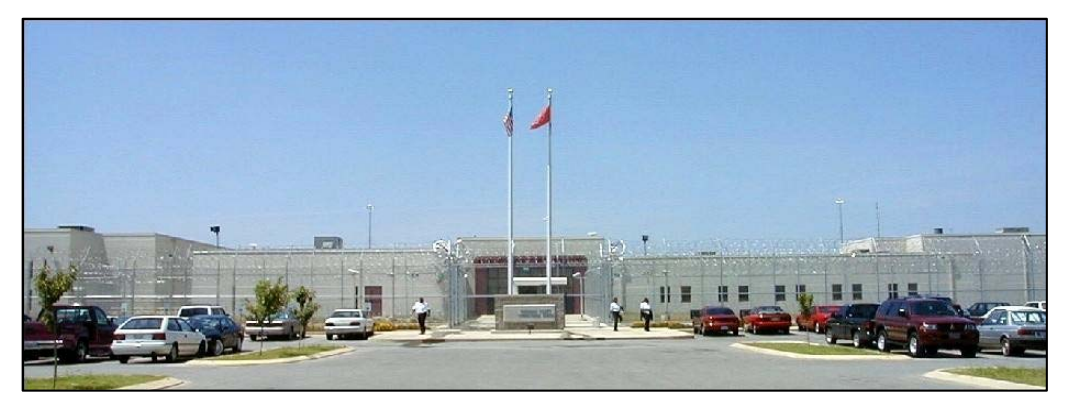
Hardeman County Correctional Facility Whiteville, Tennessee