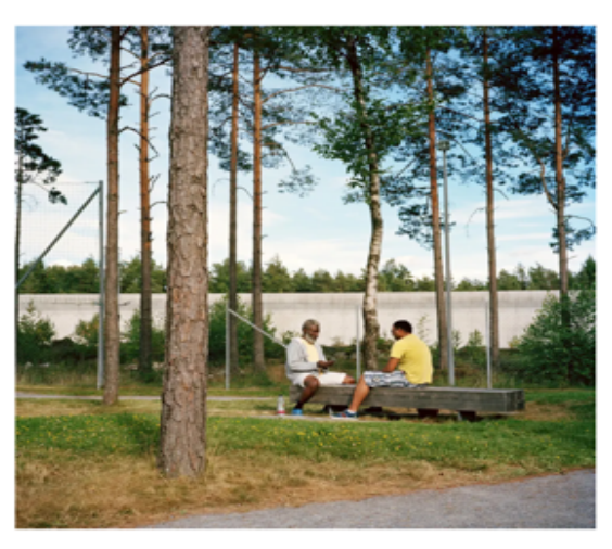
Open space, Halden Prison

The jail should have a courtroom for hearings and bench trials. That would reduce transportation costs, the security risks associated with prisoner transportation, and would expedite case processing and reduce length of stay in the jail.