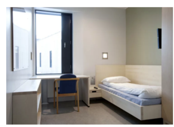
Single Occupany Cell, Halden Prison

Interior features include spacious singleoccupancy cells with tall vertical windows to admit natural light; wooden furniture (bed, desk, chair, bookcase, storage area); safety glass windows (no bars); the use of materials that dampen sound and provide good acoustics; modules limited to 10 inmates who share a common living area or day room furnished with normal furniture and a television; spaces specifically designed for education, leisure and worship; indoor and outdoor exercise areas; a