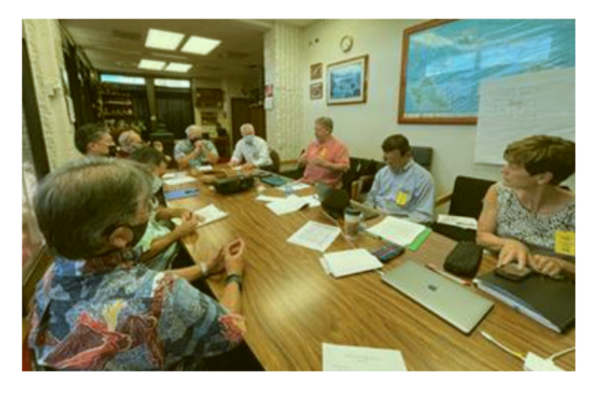
The OCCC Planning Team does not include any community stakeholders or representatives.

Associates, one of the country's leading justice architectural firms, likewise stress the need for a collaborative approach to jail planning: "Successful jurisdictions use a collaborative approach to planning that include representation of all actors in the criminal justice system and the community including advocates, judges, administrators, legislators, prosecutors, the defense bar, correctional officers, program operators, and community members. The "buy in" from key stake holders is absolutely essential .<sup>23</sup>